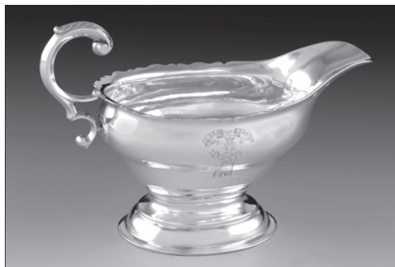
Fig. 2. Sauce boat by David Downie, Edinburgh, 1783–84, engraved with crest and motto for the Earl of Stanhope.

The Minutes of the Incorporation give a mixed impression of Downie. On the one hand, he regularly