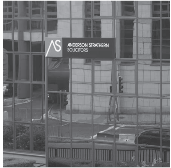
Fig. 12. Anderson Strathern, Rutland Court (overlooking the Western Approach Road), September 2008. ( Hector MacQueen. )

It is not yet the case that the lawyers have fled the New Town as their late eighteenth- and early nineteenth-century predecessors abandoned the Old; but a similar process could well be now underway, with a