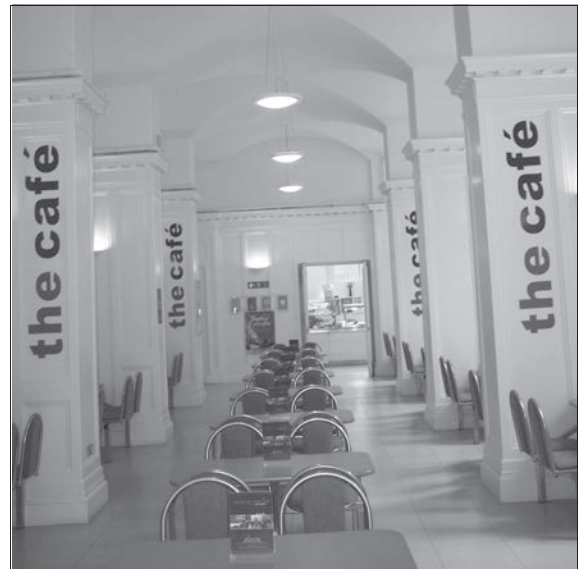
Fig. 7. Parliament House Luncheon and Refreshment Room, created 1909, as the Writz Cafe September 2008.

The lobby or vestibule to the building's public entrance in Parliament Square was also reconstructed in December by the removal of a wooden screen from behind which hitherto refreshments had been sold to patrons who consumed their purchases standing on the spot. 65 A much more spacious 'Luncheon and Refreshment Room', where customers could find a seat and tables as well as food and drink, was being built during 1908 below the enrolling room in what had been the SSC Library before 1892; it opened early in 1909, apparently to popular acclaim (fig. 7). 66