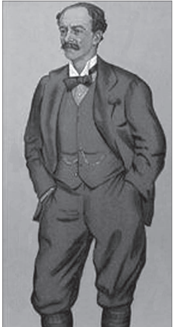
Fig. 8. Lord Dunedin as characterised by SPY.

In 1908 the courts in Parliament House were presided over by Lord Dunedin (Andrew Graham Murray), one of the big figures of Scottish legal history on most views (possibly including his own). 72 At the age of 59, he was in his prime: he had already served as Lord Advocate and Secretary of State for Scotland and would go on to be a Law Lord, retiring finally in 1932 but living on to the age of 93 (fig. 8). As his judicial title would suggest, he was an Edinburgh man, the son of a partner in Tods Murray & Jamieson WS, but he lived at 7 Rothesay Place in Drumsheugh, slightly apart from most of his professional