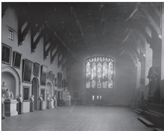
Fig. 5. Parliament Hall around 1910.

time trying to evoke the general atmosphere of the time and place, tempting though it is, and concentrate instead on aspects particular to 1908 or which have attracted less attention and comment than they perhaps deserve. 53