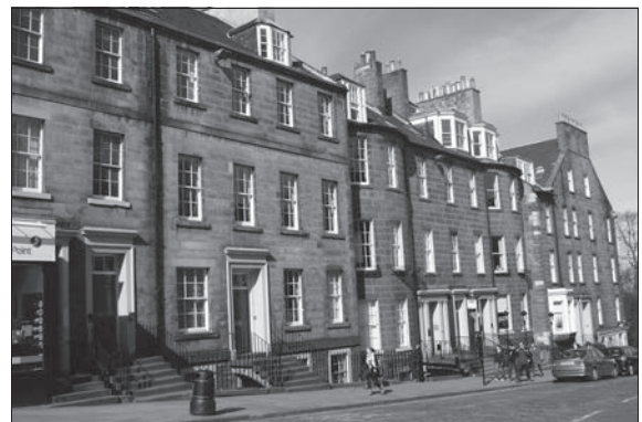
Fig. 10. Nos 54–62 Frederick Street, now the premises of Balfour & Manson, embracing the 1908 offices of Stuart & Stuart (No. 56) and Duncan Smith & MacLaren (No. 62).