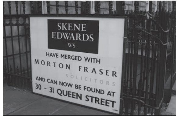
Fig. 2. No. 5 Albyn Place, September 2008.

in September 2008: Murray Beith Murray moved to offices in Glenfinlas Street, while Skene Edwards was subsumed in Morton Fraser. Probably the firm closest now to its 1908 home is Bell Scott, which has merely moved from one side of Hill Street to the other, while Balfour & Manson has shifted one block westwards in going from their Hanover Street address in 1908 to their present (much larger) one in Frederick Street. 13 Alex Morison & Co (now Morisons) has moved from mid to west Queen Street, but their current offices are in Erskine House at No. 68, a greater remove from No. 33 than might appear at first sight to the uninitiated. 14