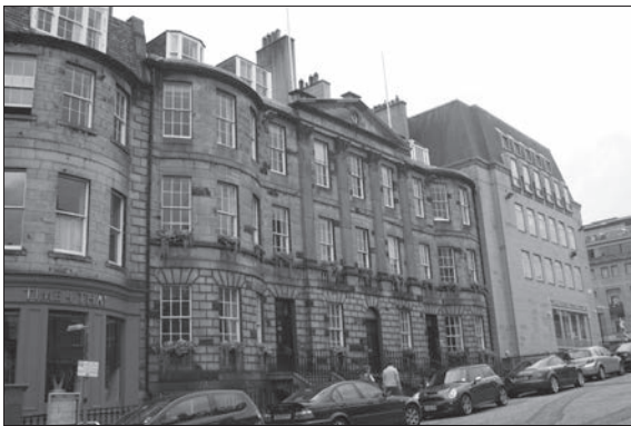
Fig. 1. Murray, Beith & Murray, 39–43 Castle Street, 1861–2008. (Hector MacQueen.)

For only two could complete continuity of location be claimed down to the time at which I began to write this paper. Murray Beith & Murray WS (slightly rebranded to Murray Beith Murray) were still at 43 Castle Street, where they had been since about 1861, although their business had expanded since 1908 also to incorporate Nos 41 and 39, the latter the former house of Sir Walter Scott (fig. 1). 11 Skene Edwards & Garson (abbreviated to Skene Edwards) were at 5 Albyn Place, where they had been since around 1888 (fig. 2). 12 For each of the firms, however, the remarkable continuity of place was broken or lost