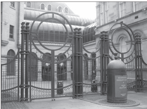
Fig. 11. Edinburgh Sheriff Court, Chambers Street, opened 1995. (Hector MacQueen.)