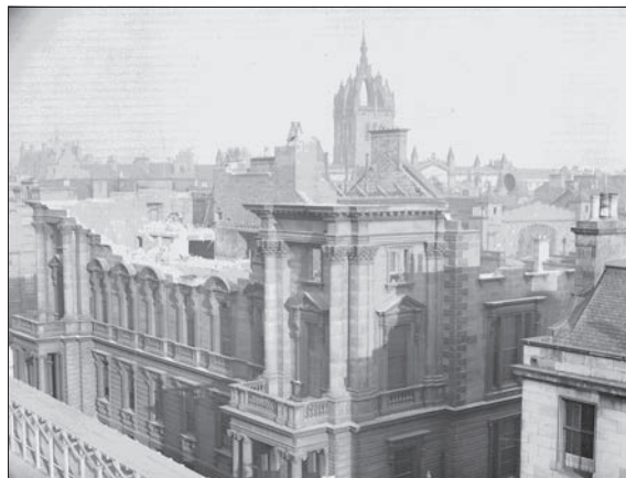
Fig. 6. Edinburgh Sheriff Court, George IV Bridge, in course of demolition, 1938.

In addition to the Parliament Square complex, just around the corner on George IV Bridge stood the Edinburgh Sheriff Court, a building erected to a design by David Bryce that ‘combined a restrained palazzo central section with the more forceful element of single-bay flanking wings with attached columns’ (fig. 6). 58 It was on what is now the site of the National Library of Scotland and so more or less backed onto and over the Advocates Library and Parliament House: ‘a cuckoo in the bibliographic