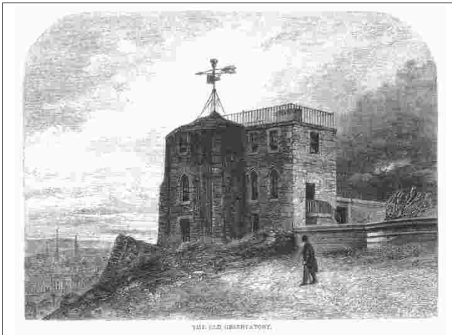
Fig. 4. The dwelling house and makeshift observatory, designed by Craig with the technical specification provided by Professor John Robison, and probably completed by 1777. From the title page to Astronomical Observations made at the Royal Observatory, Edinburgh [for 1843] (1850). (Bodleian Library.)