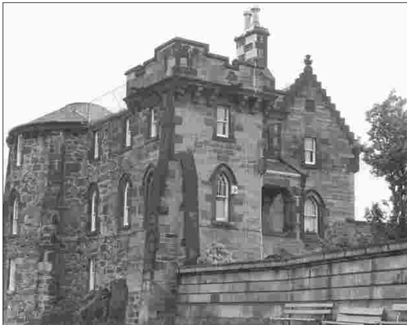
Fig. 5. Additions designed by H. M. Office of Works to convert the 1777 building to an enlarged dwelling house, 1886.