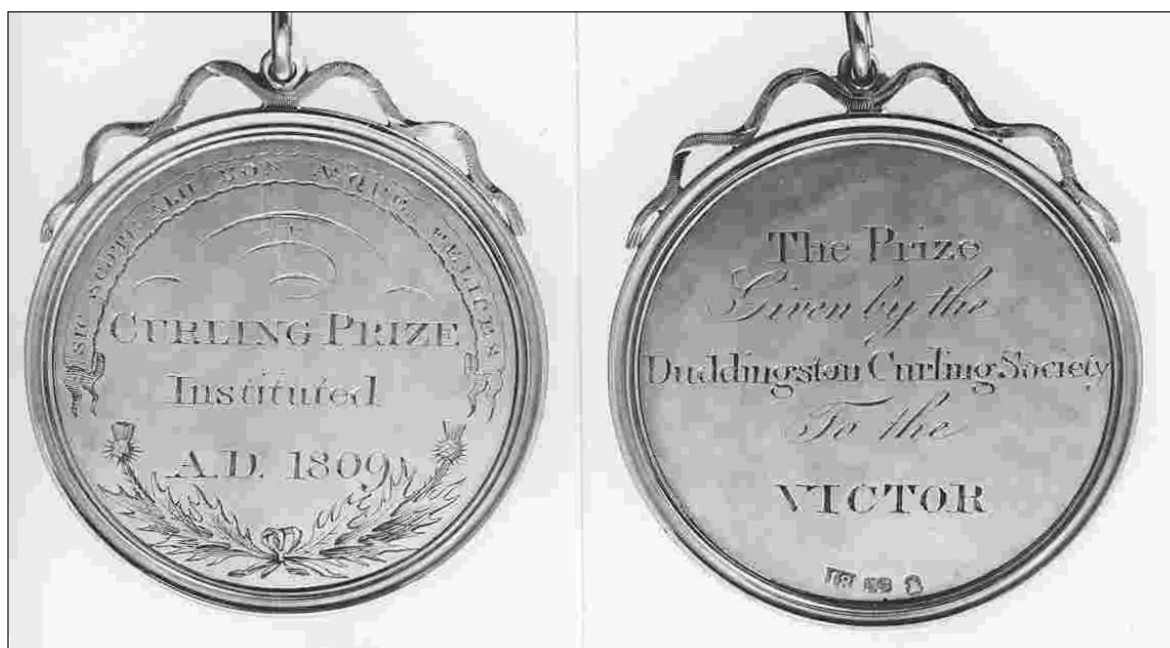
Fig. 2. Obverse and reverse of the gold points medal of 1809.

the year'. The prize, a simple gold medal, chastely inscribed with the society's Latin motto and a couple of elegant thistles to emphasise the Scottishness of the game, is now in the possession of the present Duddingston Curling Club (founded 1895), having been rescued from the jeweller's melting pot in 1977 (fig. 2). There follows the 'Report of the Committee appointed for carrying into execution the business of the Prize Medal':