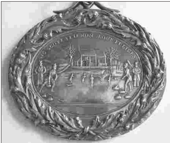
Fig. 4. Obverse of the badge struck after 1825, with Playfair's curling house shown. This example is from one of the Duddingston badges incorporated into a trophy for a different club, Carnwath, to whom it was presented in September 1832 by Sir Alexander Macdonald Lockhart, who joined the Society in December 1815.

and which had been at their admission lodged with the Master of Stones' and that he intended to raise the