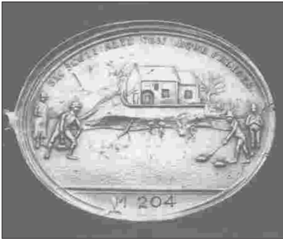
Fig. 1. Obverse of the badge of 1802. The curlers are at play on Duddingston Loch below the kirk and their patriotic motto.

An important development took place at the anniversary meeting of 1803 when: