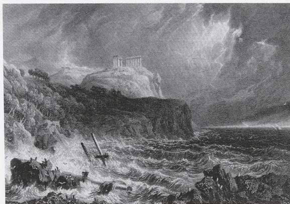
Fig. 5. 'Promontory of Sunium, from the Sea', etching (9.4 x 14.2 cm) by William Miller after H. W. Williams, published in part 10 of Select Views in Greece (1828).

His patron was William Douglas of Orchardton MP, a wealthy young man who can be associated with Williams from at least 1805. Their continental itinerary developed as the journey progressed and at one stage a side trip to Egypt was proposed before being dropped. 19 An extended visit to Elba did however occur, producing a 'View of the Fortress of Porta Ferrajo', and the publication of a drawing of the 'Palace of Napoleon'. 20 While in Italy Williams was