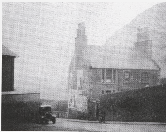
Fig. 1. Craigside House, or Dumbie House, Dumbiedykes, Edinburgh (demolished).