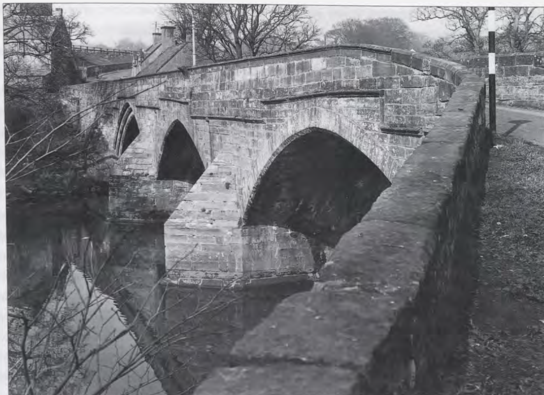
Fig. 4. Old Cramond Brig, 1965. (RCAHMS, ED/1019.)