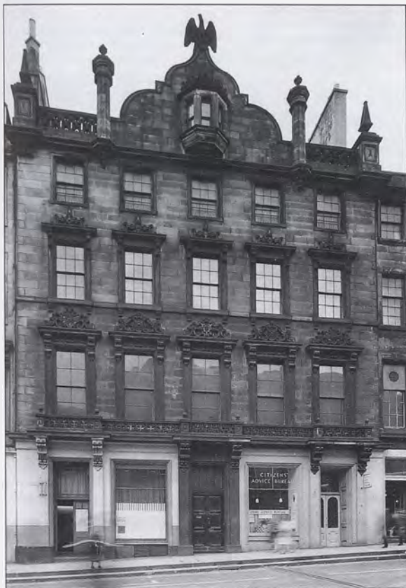
Fig. 3. Frontage to No. 7 Melbourne Place, 1965, showing the main entrance doorway, flanked on either side by shops. The Society's premises embraced the five windows on the first, second and third floors. The eagle, with spread wings, is mounted on the gable on the fourth storey.

The handsome group of buildings along Melbourne Place had been erected in 1835, following