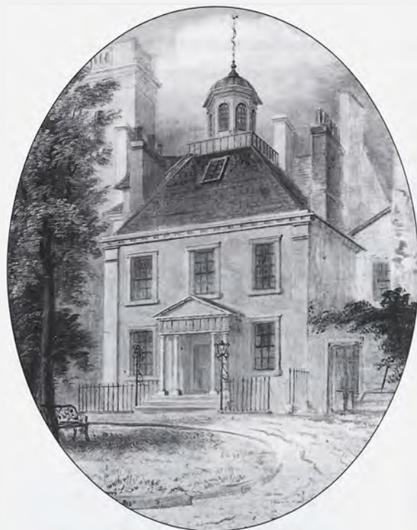
Fig. 2. Painting by Mr Dallas of the Royal Medical Society's Hall in Surgeons' Square as it appeared shortly before demolition in 1853 (now in the Society's meeting hall in Bristo Square).

An oil painting showing the old Hall in Surgeons' Square, painted by a Mr Dallas, was presented to the Society by some of its members in March 1855 (fig. 2). The fact that the Hall stands in isolation in the picture