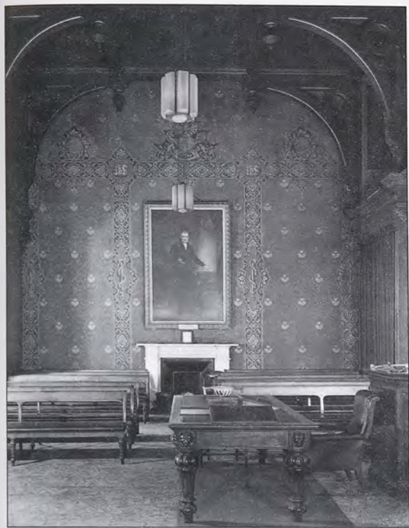
Fig. 5. Southern end of the hall, 1965, including the painting of Andrew Duncan, Senior. Note, in particular, the patterned wall covering with its ornate borders.

A.D. 1737', while the other proclaimed 'Incorporated by Royal Charter A.D. 1778' (see fig. 5). 23 The whole impression was of a very conservative gentlemen's club, which is exactly what it was until the last year of the Society's existence at Melbourne Place, in 1964, when female medical students were first admitted to membership of the Society. 24