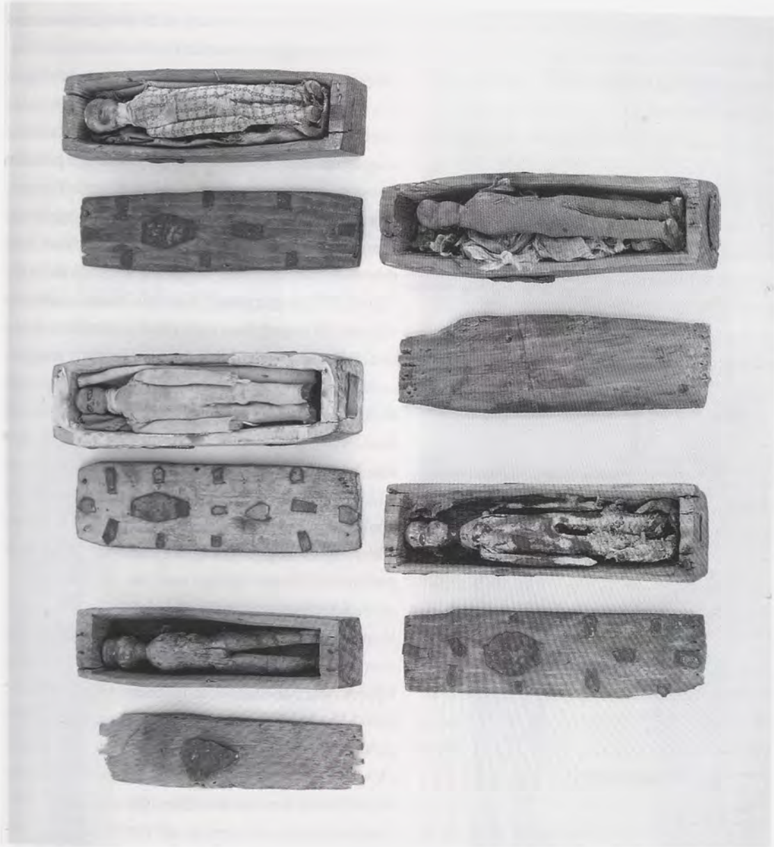
Fig. 2. Five of the miniature coffins, with their lids and figures, showing the external decoration and the different states of preservation of the clothing. These examples all have square-cut edges to the coffins. Left to right: above - Nos 1, 2, 4; below - Nos 6 and 8. (NMS.)