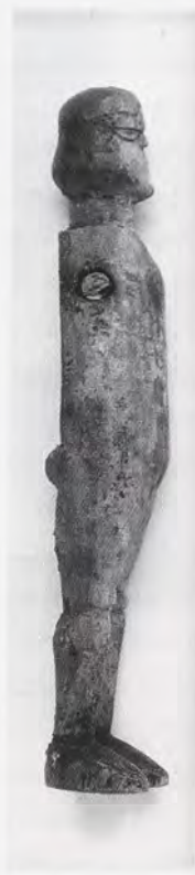
Fig. 4. Side view of figure No. 5 showing the modelling of the head and legs. (NMS.)

The description of the figures in the Society’s Proceedings at the time of the accession in 1901 stated that there was ‘a perceptible difference in the size and make of the bodies as well as in the features, which seems suggestive of the idea that the different effigies are intended to represent individuals’. 31 However, these differences extend only to the girth or weight of the figures and, as has already been noted, the heights and vertical proportions of the figures are almost identical. Although the shapes of the heads of the figures differ, the writer of the description in the Proceedings did not appreciate that the working of the facial features shows remarkable similarities: all