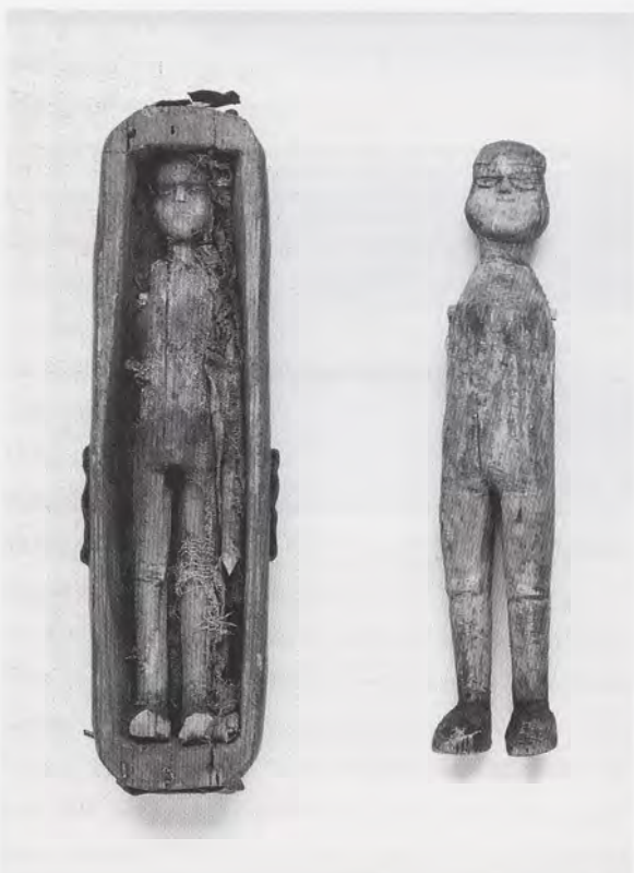
Fig. 3. Two of the figures, Nos 3 (left) and 5 (right), shown for comparison in size and features.

Little has been said about the figures inside the coffins – the initial account in The Scotsman , for example, noted only that ‘the faces in particular [are] pretty well executed’. 29 In fact the carving of these figures, which are in a close-grained white wood which may also be Scots pine, is excellent, and the quality of the detail is remarkably consistent over all the figures. Some of the figures are covered by cloth (which is described below) but the carved detail can be felt through the cloth and it can be determined that the vertical proportions of the figures are almost identical, even though some are slimmer than others (fig. 3). The heights of the complete figures vary only