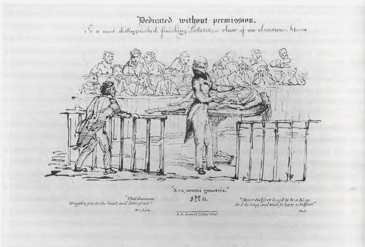
Fig. 7. Robert Knox giving an anatomy demonstration to students: lithograph caricature by Daniel Macnee produced in 1829 at the time of the Burke and Hare case. The Latin tag alludes to night, in the form of Knox, inducing sleep of a more permanent type.

These killings were, of course, committed in Edinburgh by two Irish labourers who solved the problem of supplying corpses for dissection to the medical students of Edinburgh by the simple expedient of manufacturing corpses to meet demand. Burke and Hare were employed on the construction of the Union Canal and lodged in Portsburgh, the part of Edinburgh west of the Grassmarket, just outside the old city boundary at the West Port. The corpses of their victims were sold to the dissecting rooms of the prominent anatomy lecturer Rober Knox at Surgeon Square (fig. 7). Burke and Hare's first sale, in December 1827, was that of 'old Donald', a lodger who had died of natural causes; but the sixteen corpses which followed (see Appendix ) were all mur-