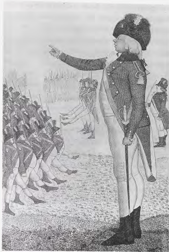
Fig. 5. Lt. Col. Patrick Crichton of the 1st Regiment of the Royal Edinburgh Volunteers, drilling the 'awkward squad' on Brunsfield Links: etching by John Kay in 1794.

Nine of the original seventeen coffins were destroyed, and of the eight that survive several have been badly affected by damp. The cloth wrappings of these figures has largely decayed, but in the best preserved examples it is clear that the 'occupants' of the coffins have been fitted with fabric grave clothes. Single-piece suits, made from fragments of cloth, have been moulded round the figures and sewn in place. With some figures there is evidence of adhesive under the cloth. The style of the dress does not relate to period grave clothes, and if it is intended to be representational at all then it is more in keeping with everyday wear. 33 However, the fact that the arms of figure No. 8 were already missing when the figure was clothed suggests that the fabric was merely