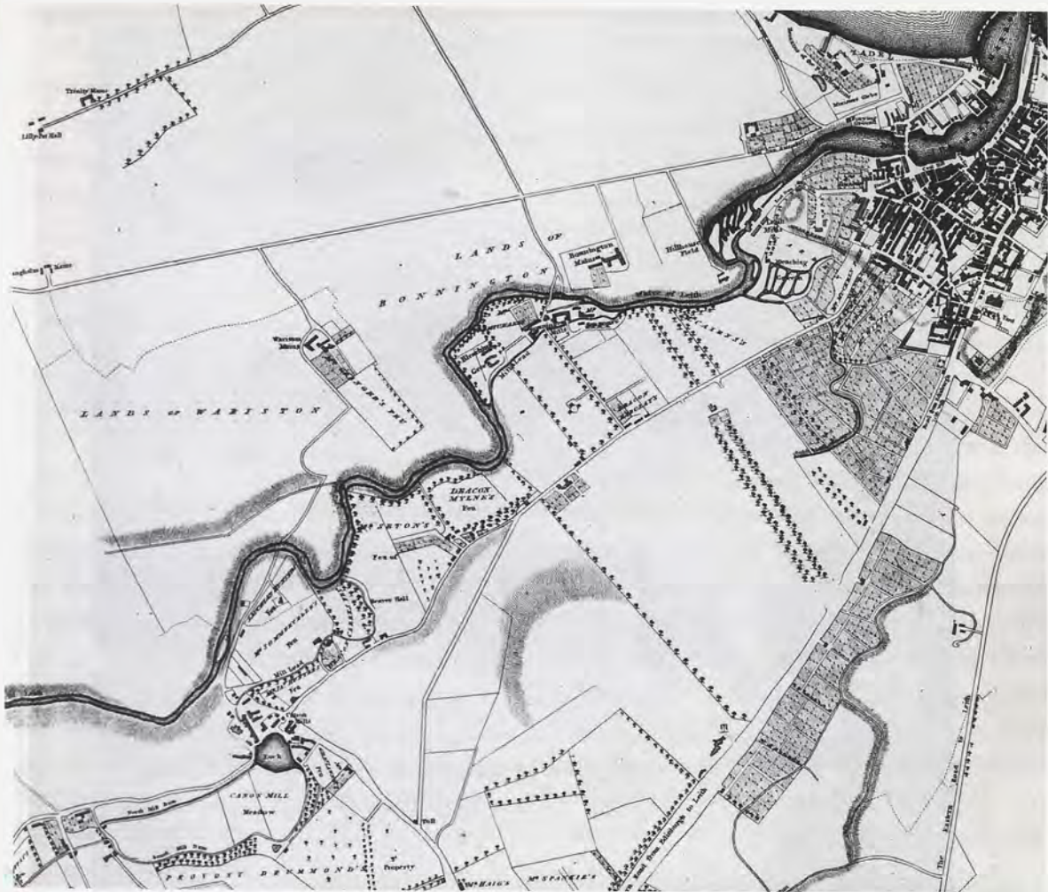
Fig. 2. Part of Robert Kirkwood's 'Ancient Plan of the City of Edinburgh' (published 1817), showing the area to the north of Edinburgh according to an original survey by Fergus and Robinson in 1759. (National Library of Scotland.)

Commendatar allegeis, and mair of the sowme of £3 for the said Johnnes landis of Huik, extending as the said Commendatar allegeis, to £6 land lyand within the baronie of Kers and schirefdom of Striveling'. 9