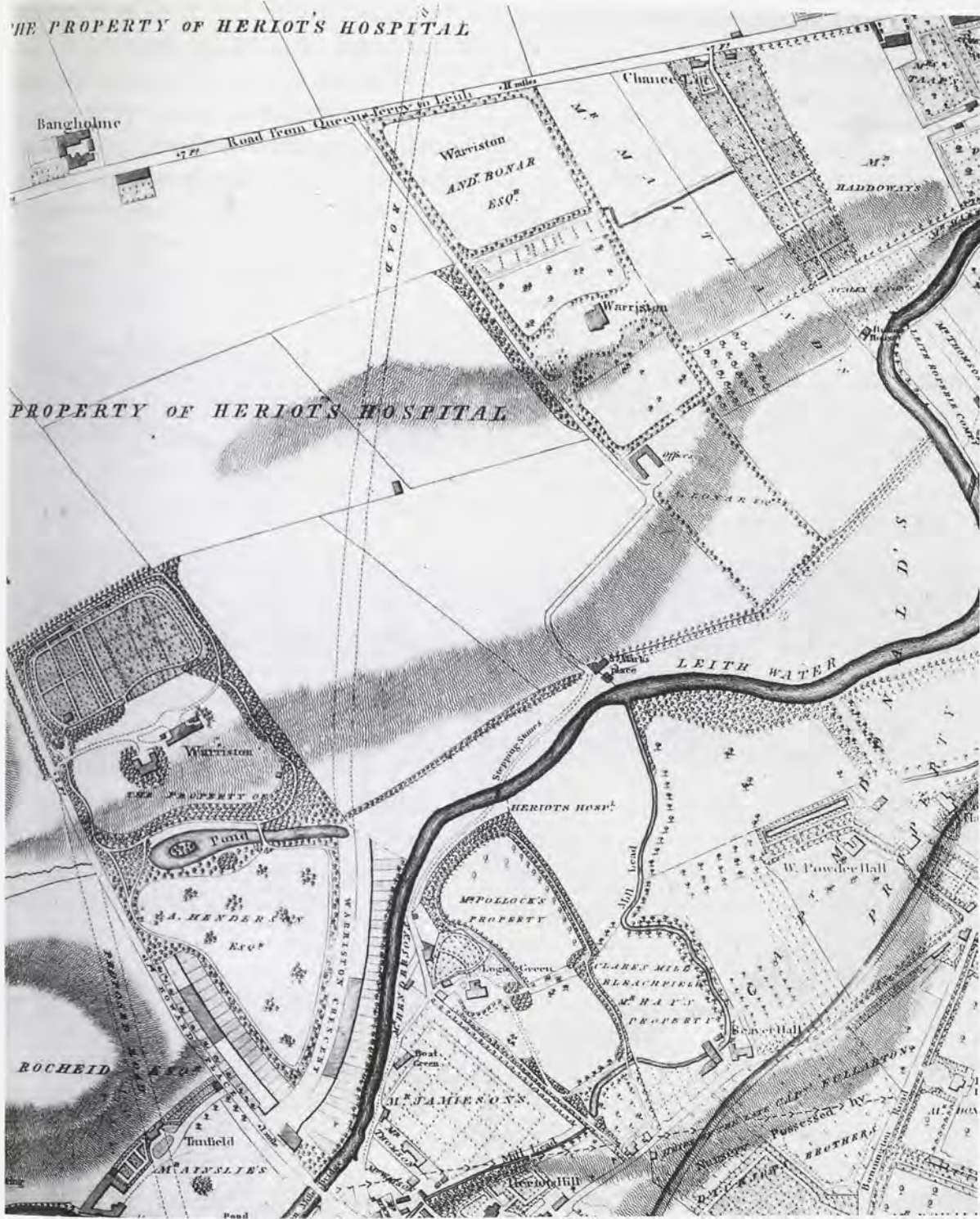
Fig. 5. Part of Kirkwood's Plan of Edinburgh and its Environs, 1817. (National Library of Scotland.)