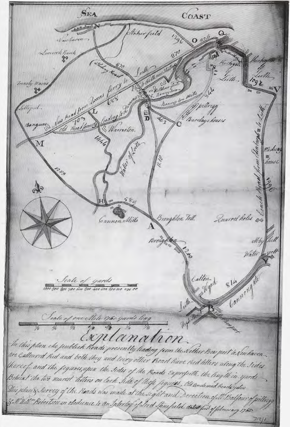
Fig. 3. Plan of the public roads leading from the Netherbow Port to Newhaven, made for James Balfour of Pilrig, 1765. The new Warriston Road has the figure 1444 against it; the road marked 1259 is on the line of Inverleith Row. (Scottish Record Office, RHP 712/1.)