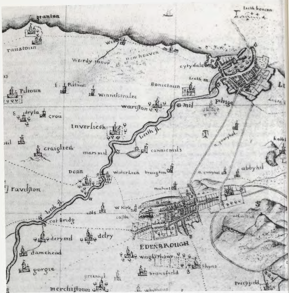
Fig. 1. Part of the manuscript map of Midlothian by John Adair, 1682. (National Library of Scotland, Map Room, Adair MSS. No. 9.)

In early times the lands of Warriston must have covered a much wider area. Lands near Newhaven are mentioned as belonging to the Laird of Warestoun in the Exchequer Rolls in 1550. 8 In 1581 a petition by the heritable feuars of the lands of Warriston includes the name of John Kincaid, complaining that 'Adame, bishop of Orkney, commen-