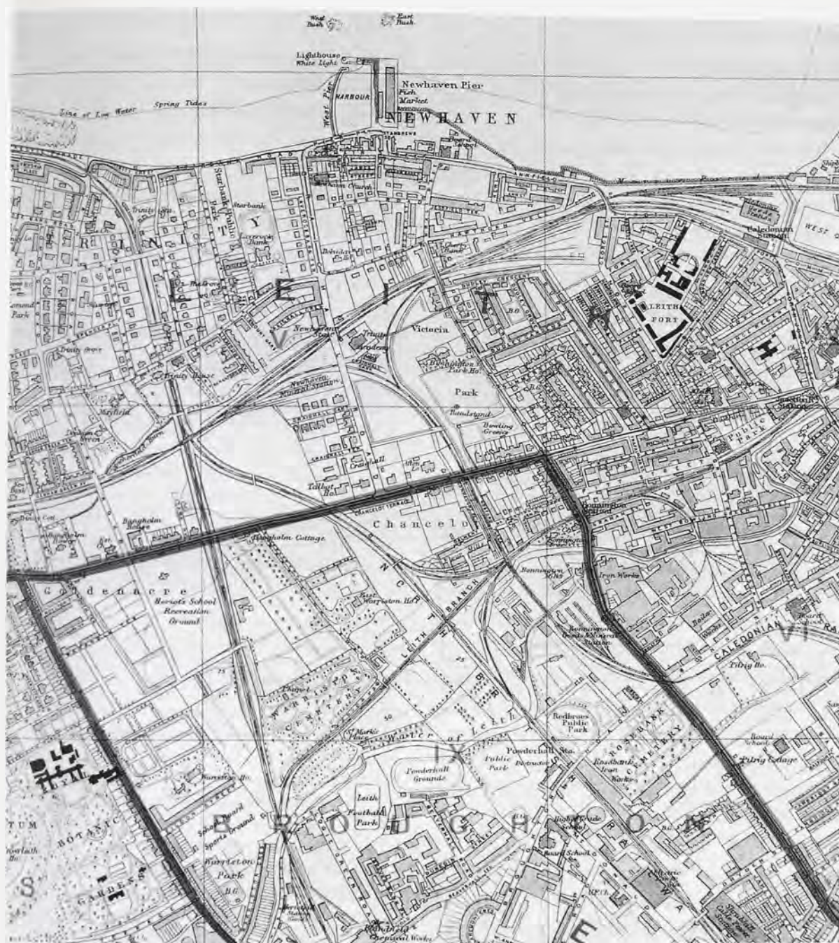
Fig. 8. Part of the Plan of Edinburgh, Leith and Portobello, W. & A. K. Johnston, 1905-06, showing the eventual layout of the railways.