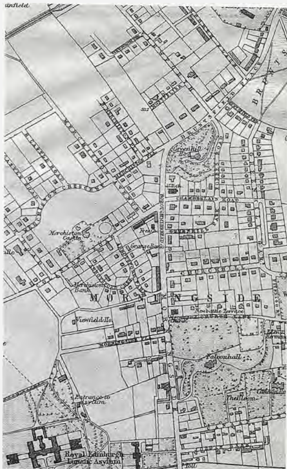
Fig. 1. The Holy Corner as shown in Bartholomew's Post Office Directory Plan of Edinburgh and Leith, 1868-69 . At this stage only two churches had been built, the original Free and United Presbyterian Churches.

The 'suburb of Morningside' mentioned above can be identified as the areas of Merchiston and Greenhill (fig. 1). All four churches were built on land originally belonging to these two estates, the Greenhill estate on the east of Morningside Road and the Merchiston estate on the west. 2 In 1814 Sir William Forbes had bought the Greenhill estate. 3 Some time before 1852 a number of plots had been feued off from the estate for houses along what is now known as Greenhill Gardens. 4 In 1729 the Merchiston estate, originally belonging to the Napiers of Merchiston Castle, had come into the hands of the Governors of George Watson's Hospital. 5 Most of the estate area was well to the south west of that under discussion, and stretched as