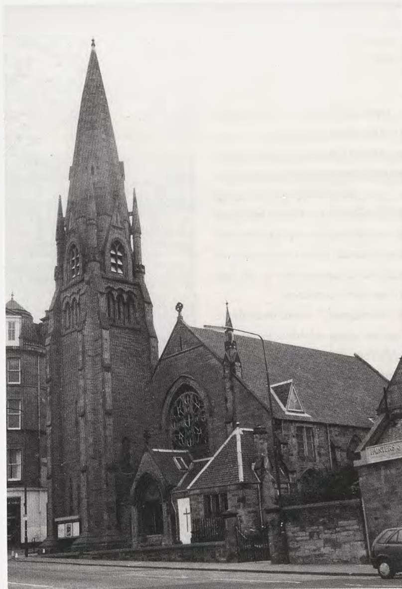
Fig. 2. Morningside Baptist Church (formerly Free Church), photographed from the north east.

The earliest of the four churches now standing at The Holy Corner is Morningside Baptist Church, on the south west (fig. 2). This church, acquired by the Baptists in 1894, had previously housed the Morningside Free congregation, and was built in approximately 1872. It replaced an earlier, smaller