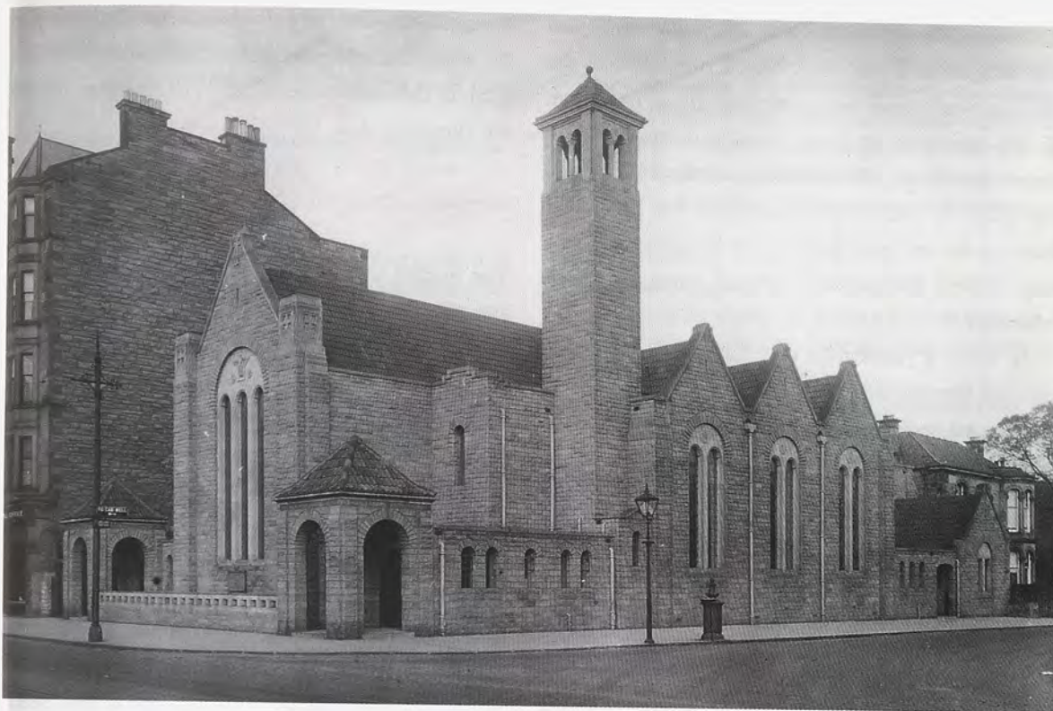
Fig. 5. Morningside United Church (formerly Congregational Church), photographed from the south west.

south 'transept'. A number of other very interesting changes were also made between the first and second sets of plans; these changes bear no relationship to the required extra accommodation. Stylistic details were altered, giving the building a completely different flavour. The tall windows, originally to be pointed on facade and side elevations, were changed to become round-headed. The first set of drawings show these tall pointed windows filled at their heads with simple tracery. Likewise, the arches of the open porches of the front of the building were originally to be pointed. The openings at the top of the tower were originally rectangular and glazed with quatrefoils at the top, two on each side of the tower. They were changed to open arches as they now appear.