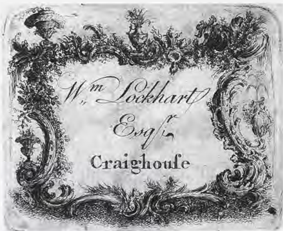
Fig. 1. Bookplate of William Lockhart of Craighouse. (Private Collection.)

THE BOOKPLATE of William Lockhart of Craighouse, in spite of its diminutive size, has sufficient stature as a work of art to suggest that there may have been a late flowering of rococo design in Scotland (fig. 1). The cartouche is immediately striking in its asymmetry but also for the degree of detail packed into its mere 1 7/8" x 2 1/4". Studying its ornaments is rather like taking a stroll through a rococo garden diversified by the liveliest of incidents both architectural and botanic. There are no less than four vases of differing forms spouting fountains, vapours or nosegays, while the thistles at the foot give way to roses and a variety of floral sprays. Although the design might be criticised for a certain 'busyness', the etcher has a certainty of touch which is the more impressive in this tiny compass and the forms are built up with both control and clarity.