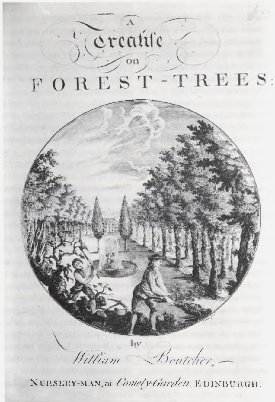
Fig. 2. Engraved title page of William Boutcher's Treatise on Forest Trees , 1775.

how Boutcher went about this side of his business: 'He undertakes the planting and fully executing of Gardens and all other plantations at an agreed Price, if not exceeding 20 miles from Edinburgh, will insure the Trees planted by his Direction at 10 per cent and is at