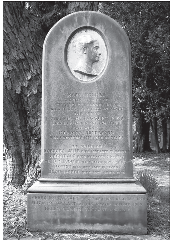
Fig. 1. McTaggart Family Gravestone. Newington Cemetery.

Newington Cemetery in south Edinburgh was originally called Newington Necropolis but also features in old records as Echo Bank Cemetery or the Southern Cemetery. (A few elderly residents still talk of ‘Eckiebank’ but Echo Bank as a locality was effectively obliterated by the development of Prestonfield housing estate. Perhaps Prestonfield has a more prestigious ring.) The cemetery was established as a commercial venture in 1846 and subsequently laid out by the architect David Cousin (1809-1878). Cousin joined the Free Church after the Disruption in 1843 which contributed to the breakdown of the Auld Kirk system of parochial graveyards, and, combined with population growth, probably stimulated demand for new and more gracious facilities. From the